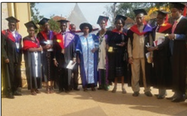
5th group of HAU BScs at their graduation ceremony at Makerere University, March 2017.

Teaching of undergraduate medical and nursing students and others commenced in 1994 and now includes several diploma and degree programs